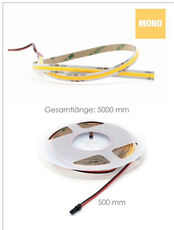
Gesamtlänge: 5000 mm